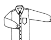
White Dress L/S Shirt